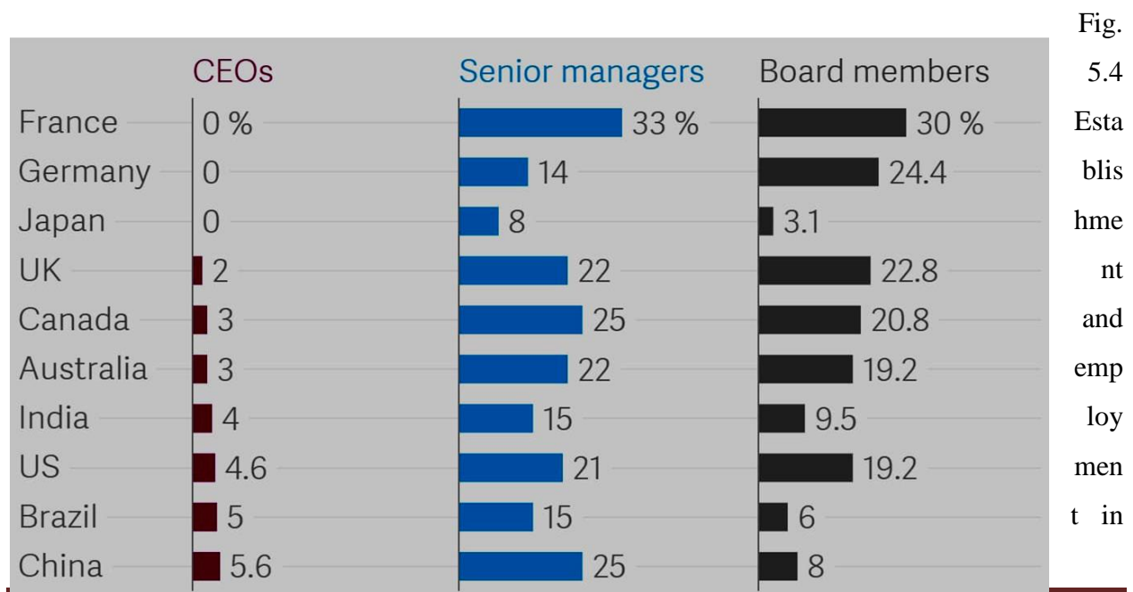
Fig. 5.4 Establis hme nt and emp loy men t in

The table also presents the top professions women entrepreneurs aspire for in India. Maximum women entrepreneurs belong to fashion category.