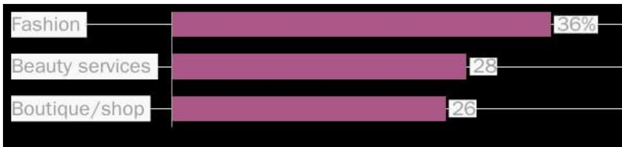
Source: Britannia Marie Gold Indian Women Entrepreneurship Survey Report (2018)

The table also presents the top professions women entrepreneurs aspire for in India. Maximum women entrepreneurs belong to fashion category.